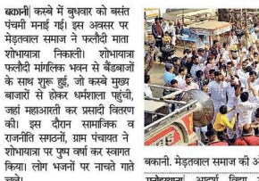
बकानी, मेड़ताल समाज की ओर से पंचमी की शोभायात्रा निकाली।

बकानी अयोधे में बुधवार को बसंत पंचमी मनाई गई। इस अवसर पर मेड़ताल समाज ने पंचमी की माता शोभायात्रा निकाली।