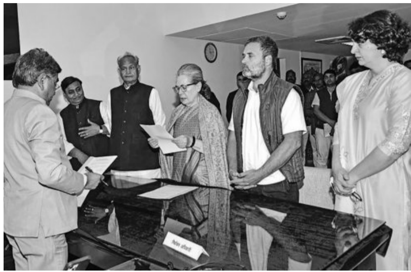
Congress leader Sonia Gandhi (centre) files her nomination papers for the upcoming Rajya Sabha polls at Rajasthan Assembly in Jaipur on Wednesday.

According to sources, Union Agriculture Minister Munda conveyed to farm leaders that the government was committed to resolving their demands, especially those of "administrative nature" at the earliest. However, a legal guarantee to minimum support price (MSP) needed through consultations to consider the