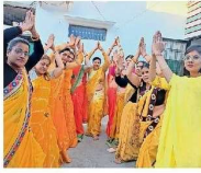
मालवाड़ी महिला मंडल ने मनाया महोत्सव।