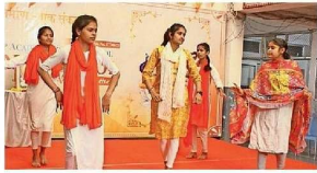
झालावाड़, बसंत पंचमी उत्सव के दौरान नृत्य की प्रस्तुति देती छात्राएं।

बुधवार को संस्कृत सैनिक स्कूल में बसंत पंचमी को समर्पित कर मातृ-पितृ दिवस मनाया गया। प्रधानाचार्य ने कार्यक्रम की शुरुआत की।