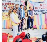
रत्नमर पीपीएस राजकीय बालिका स्कूल में कोशल बाल विकास मेला का आयोजन किया गया।

आंध्र प्रदेश में बच्चों की दौ कानूनी जानकारी एहलिया बरत रही है। ऐसे में पुलिस ने मनचलों पर अक्रुश लगाने के लिए खास पलन तैयार किया है।