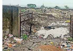
पिड़ावा, केंद्र में परे मृत पशु व फैला कचरा को सड़क तक आ रहा।

रायपुर के पास रोहपुर मार्ग पर बना नगर पालिका का कचरा संग्रहण केंद्र (डॉबिंग यार्ड) इस रोज से निकलने वाले ग्रामीणों के लिए सुनिश्चित का सबब बन गया है।