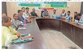
पिड़ावा, नगर पालिका में फसल बीमा की जानकारी देते हुए अधिकारी।

भास्कर न्यूज़ | पिड़ावा नगर पालिका द्वारा ग्राम में फसल बीमा को लेकर जागरूकता सृष्टि करने का आह्वान किया गया है। इसमें ग्रामवासियों और कृषि अधिकारियों को फसल बीमा से संबंधित जानकारी दी गई।