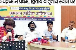
भास्कर न्यूज़ | अज

मोहम्मद रफी व किशोर कुमार को याद किया कार्यक्रम में प्रथम, द्वितीय व तृतीय स्थान पर आने वालों को इनाम दिया।